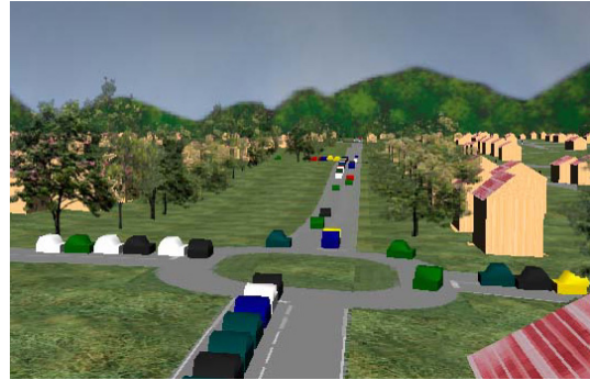
Figure 4. Vehicles approaching a roundabout

The traffic management module of the system carefully controls the traffic flows for vehicles both entering and leaving a roadway of the network. If the flow exceed the designed capacities of that roadway, congestions and delays are introduced. Figure 4 shows the virtual vehicles agents arriving at a roundabout.