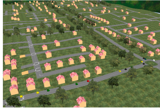
Figure 2. A screen capture of the roadway network in the simulation system

Traffic congestion and uncertainty will occur when traffic demand is higher than usual supply, which brings inefficiency to all road users. During the simulation, the state of each cell is updated according to the traffic flow. A cell is registered as occupied when there are vehicle in the cell. Otherwise it is registered as an empty cell. There will be no difference for the vehicle's exact position to the road situation as long as the vehicle is in the area defined by the cell configuration at the period of interest. The network configuration for a particular urban environment is loaded from the configuration map of the network at the initialisation stage.