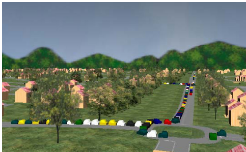
Figure 6. Traffic jam at roundabout during morning rush hours of a residential housing estate

Traffic jam occurs when the flow of input is greater the throughput.