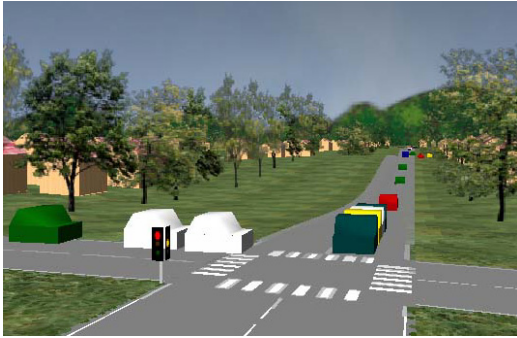
Figure 5. A queuing system of a traffic light controlled roadway.

Traffic jam occurs when the flow of input is greater the throughput.