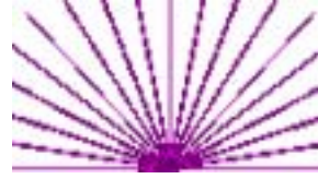
Fig. 2 The example using Wu's anti-aliasing method in white background

collection and plotting procedures are the same as that in Fig.2. Fig. 3(a) shows different dimensions lines without anti-aliasing. Fig. 3(b) demonstrates different dimensions lines with anti-aliasing.