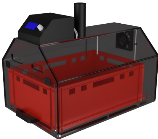
Figure 2: Visualization of the experimental breeding station

The development and tests during the construction of this device verified the functionality of the chosen solution and the box was prepared for experimental measurements of the effectiveness of individual breeding processes on the resulting product.