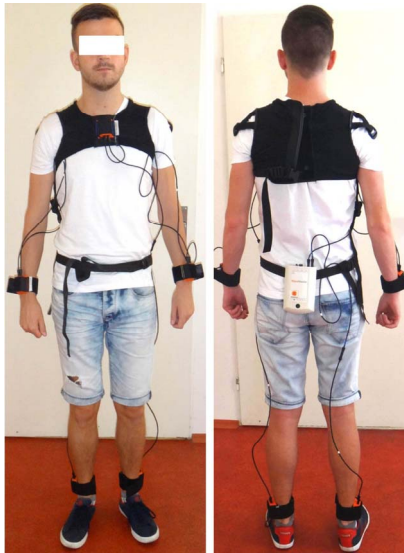
Figure 1. Arrangement of the Xsens system with five three-axis IMU used to measure accelerations of body segments, [2].