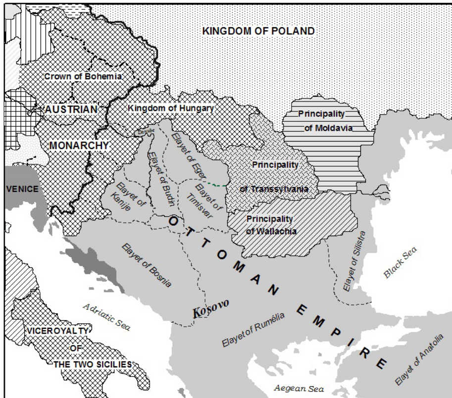
Map 1: Ottoman Empire in middle of the 17 th century

After 1526 the Hungarians had two kings, one represented the Habsburg dynasty, the other, János Szapolyai was a member of the Hungarian higher nobility. The two kings fought with each other, too, and the Turks often intervened, supporting János Szapolyai. It was at the same time that the peoples of the Balkans took part in the struggles of the Turkish army. In 1541 the Turks annexed those areas of Habsburg-ruled Hungary – including its centre, Buda – which had been conquered by them.